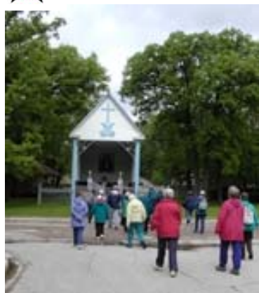
la Chappelle de Notre-Dame-du-Bon-Secours